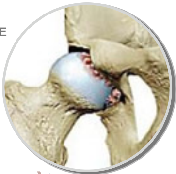
HIP BEFORE IMPLANTS